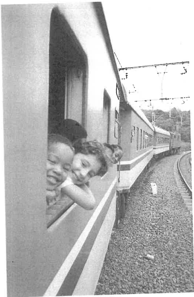
All aboard! The Gr O and Bridging classes on their train trip

The Grade 2's had a delightful day at the Willem Prinsloo Agricultural Museum . Some of the demonstrations included candle-making, milking and a donkey-driven water pump. The museum guide challenged the children with practical prob-