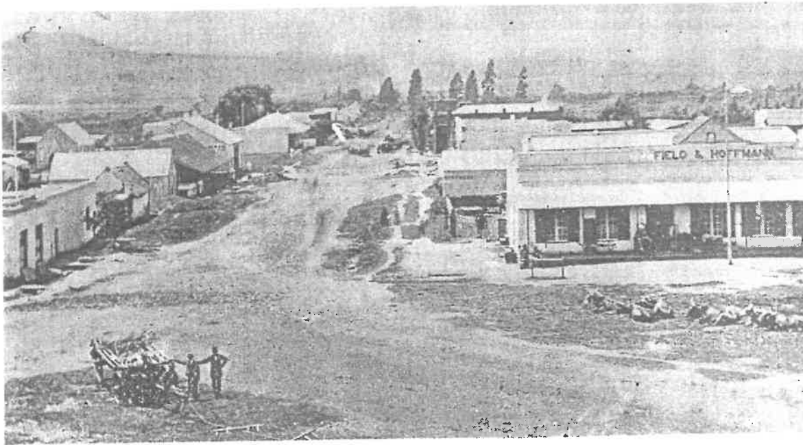
Early Pretoria (1876)

ON 17 MAY 1878, that the personnel of the Sacred Heart Mission arrived at the field of their labours.