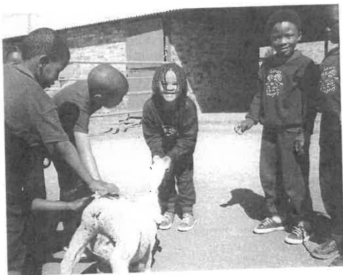
A hungry lamb at the Children's Farm is fed by the pre-school

The Grade 2's had a delightful day at the Willem Prinsloo Agricultural Museum . Some of the demonstrations included candle-making, milking and a donkey-driven water pump. The museum guide challenged the children with practical prob-