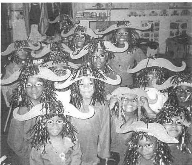
Buffaloes preparing to boogie!

I was a buffalo in the concert. We all had to practise very hard. Our wigs were tickling me very much .