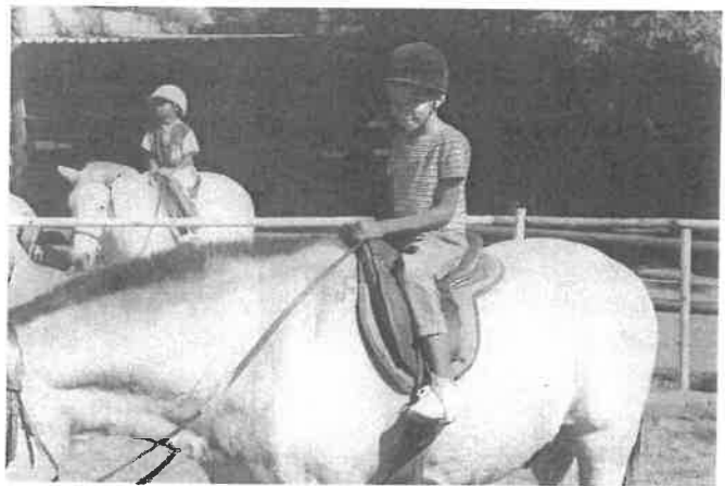
Children from the pre-school getting to know horses at the Willows Riding School.

A trip to the Children's Farm was most successful as the children were allowed to cuddle the rabbits and bottle-feed the calf. They also learnt to tell the difference between male and female tortoises.