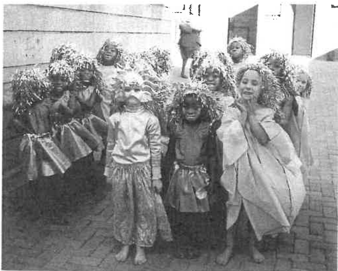
Members of the cast of "The Tokbird"

The singing in English and the vernacular during the Mass was particularly beautiful.